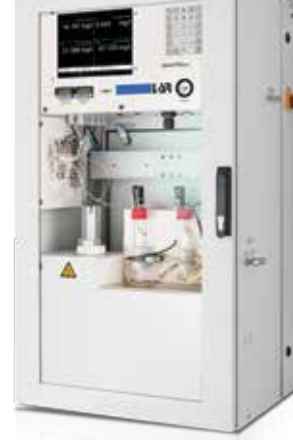
Fast and precise – the QuickTOC<sub>NPO</sub> is reliable!