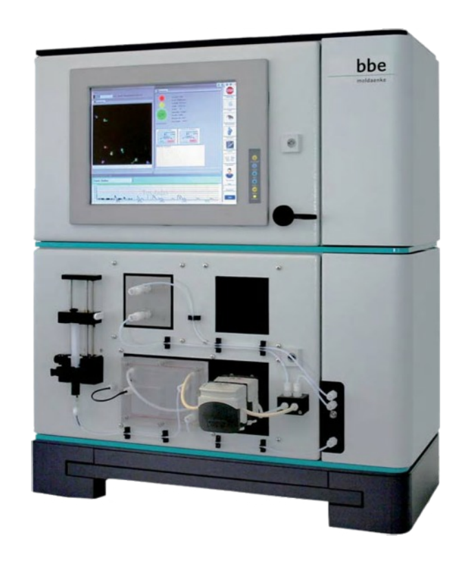
Daphina Toximeter II in the lab

A powerful instrument for water toxicity assessment