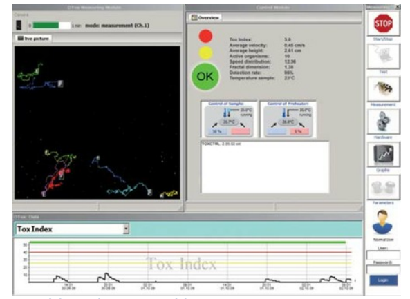
Live picture and image trace screen

Test substances in static tests and in the bbe Daphnia Toximeter