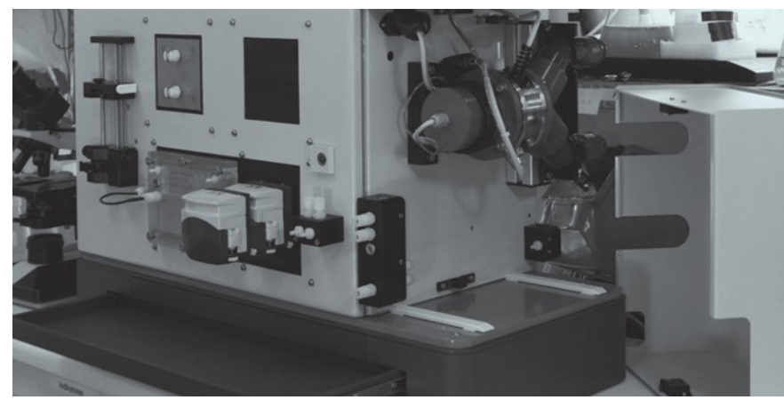
Daphina Toximeter II with drip pan, pumpheads and filter unit