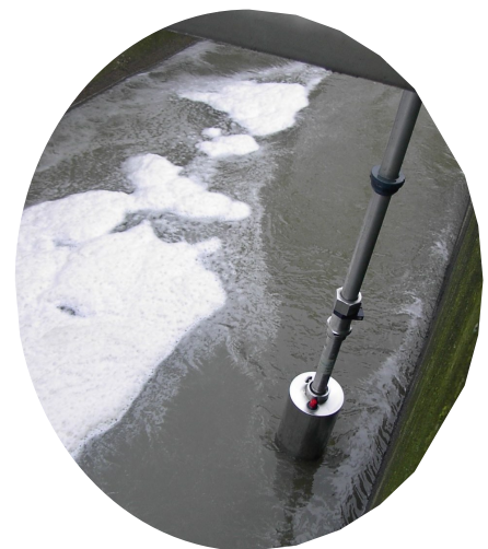
PBS in Final Effluent