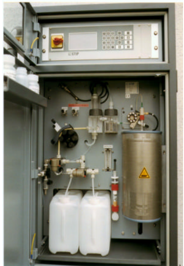
STIP Isco on-line TOC analyzer

Written for public distribution and reprint November 2000